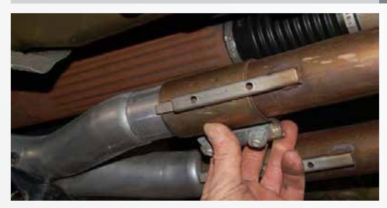
Install the provided studs into the collector flanges of the BBK Headers. Install the BBK X-Pipe kit.